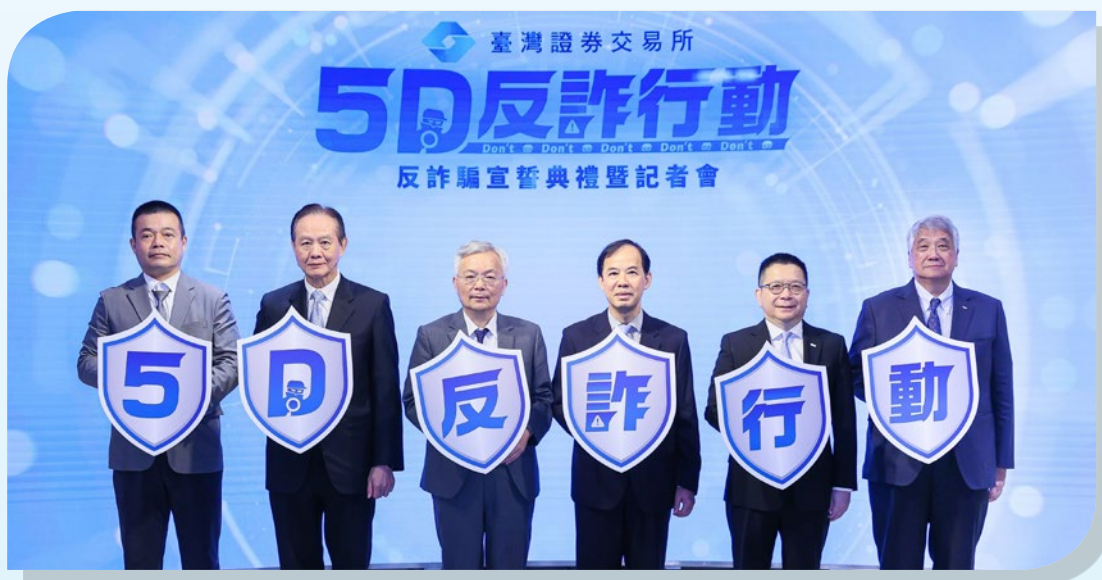
本公司啟動「5D 反詐行動」反詐騙誓師大會 The TWSE launches the "5D Anti-Fraud Initiative."