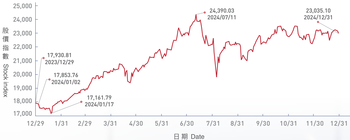
2024 年加權股價指數走勢圖 2024 TAIEX Chart

The TAIEX chart for the year of 2024 is as follows: