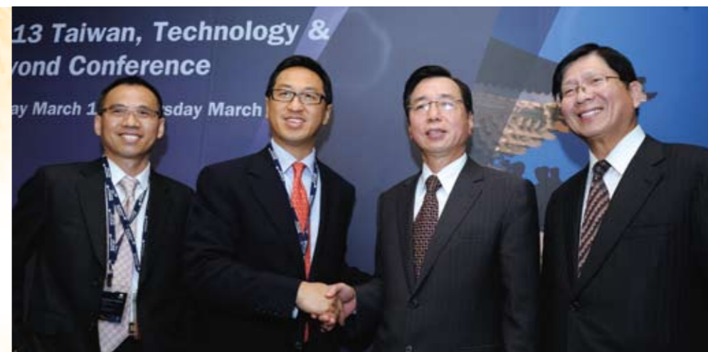
國際交流 International collaboration and cooperation