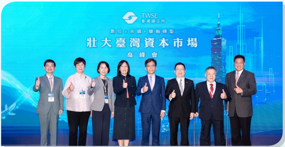
本公司舉辦「壯大臺灣資本市場高峰會」 The TWSE holds the "Taiwan's Capital Market Summit."