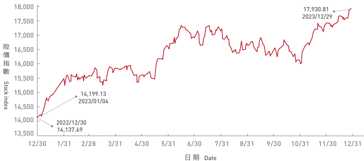
2023 年發行量加權股價指數圖 2023 TAIEX chart

The TAIEX chart for the year of 2023 is as follows: