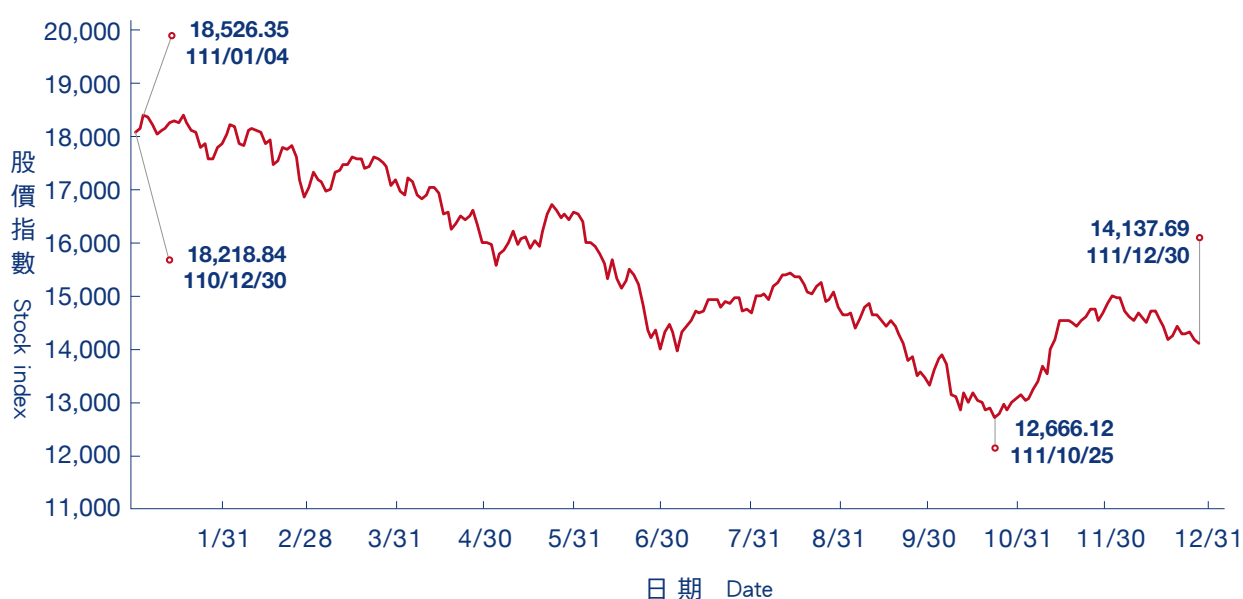
2022 年發行量加權股價指數圖 2022 TAIEX chart

The index price chart for the year of 2022 is as follows: