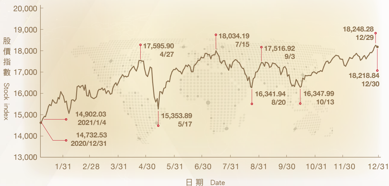
2021 年發行量加權股價指數圖 2021 TAIEX chart

The year 2021 witnessed global stock markets trending upwards from easing market capital flows. The Taiwan stock market entered a brief period of correction due to a local outbreak of COVID-19 in May; but thanks to the country's timely pandemic control measures, TAIEX rebounded in June, and closed above 18,000 points for the first time on July 15. In addition, due to the robust global economic recovery, continued strength of Taiwan's exports, and impressive revenues and profits posted by listed companies, Taiwan stock trading volume and value experienced sweeping growth. TAIEX posted 18,218.84 points on the final business day of 2021, a surge of 23.66% over the end of 2020. The index price chart for the year of 2021 is as follows: